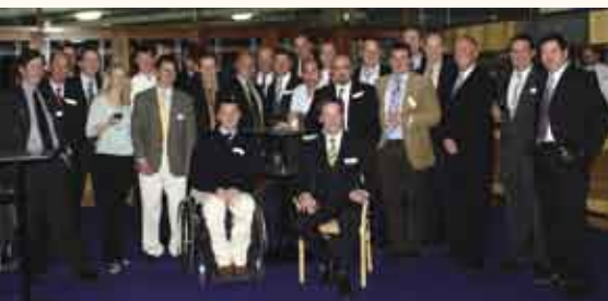
The large 1986 contingent.