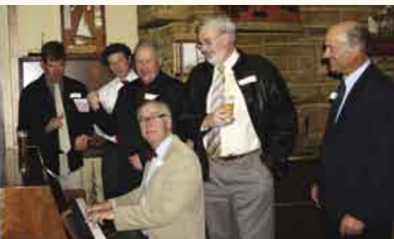
The gang of 1966 (plus one ring in) at the piano performing the School Song.