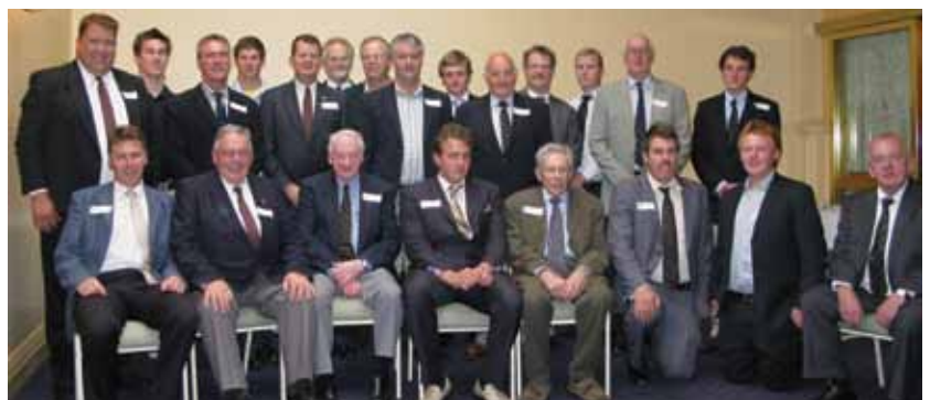
Fathers, grandfathers, sons, brothers and uncles who attended the Ray Vincent Lunch.

We were especially delighted that the sesquicentenary celebration was able to be held at Hadley’s Hotel, the same venue at which that first event was held 150 years ago. There would be very few organisations that can make this claim!