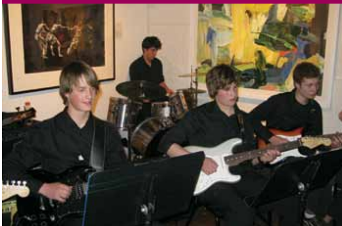
The Hutchins Guitar Jazz Ensemble performing at the Art Prize launch.

A record 2000 visitors viewed the exhibition over the twelve days of its duration. Feedback to organisers was invariably complimentary.