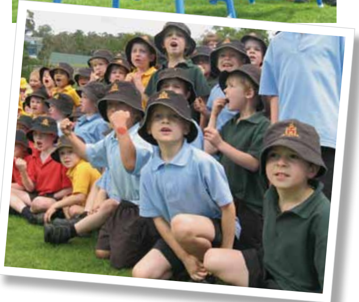
The Kinder “team” on a mission at Valhalla Ice Cream factory.