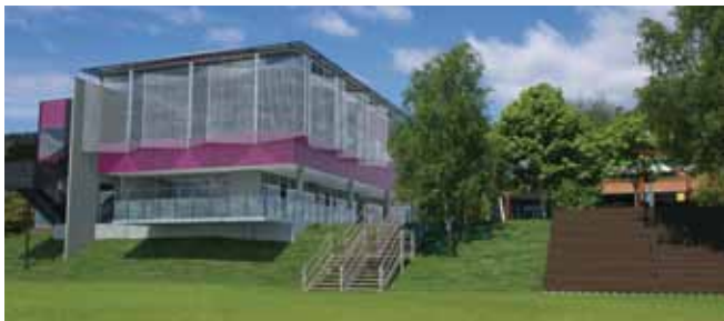
This is how it will look by the end of 2010

In the meantime, the Toppin Room has been put to work as a temporary library.