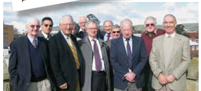
Old Boarders gathering at the Tower in the Old School in Macquarie Street during Anniversary Week.