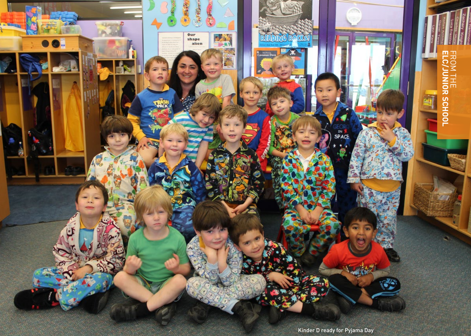
Kinder D ready for Pyjama Day