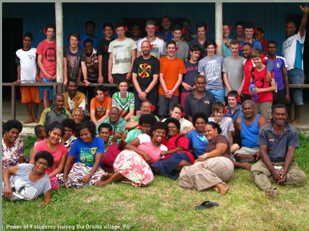
Power of 9 students visiting the Draiba village, Fiji

The group came back inspired to be more connected to each other, the environment they live in, their families and community. 🌍