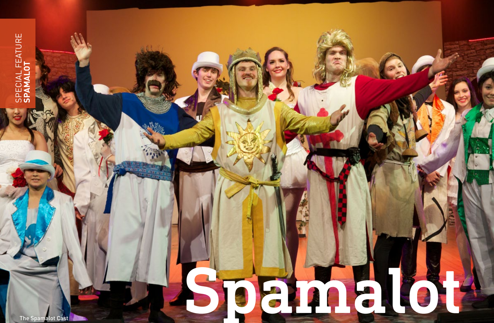
The Spamalot Cast