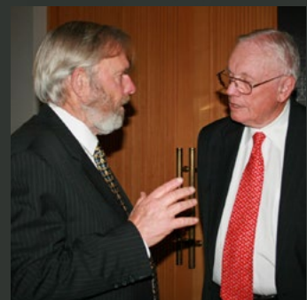
Hamish with Neil Armstrong