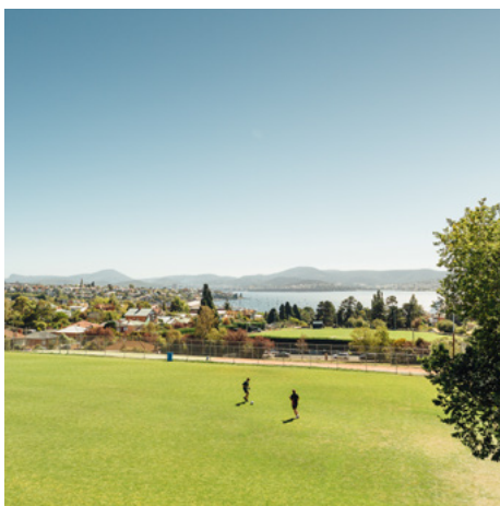
The School grounds which overlook the River Derwent.

Choosing a boys school has many advantages. At Hutchins we provide learning spaces specifically designed for teaching boys, this includes providing resources and designing programs that meet their educational and developmental needs. We employ teachers who are passionate about teaching and who receive continuous professional development in best practice, innovative and creative learning.