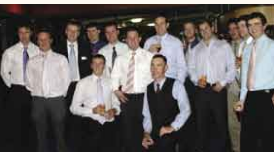
The noisy 1996 group.