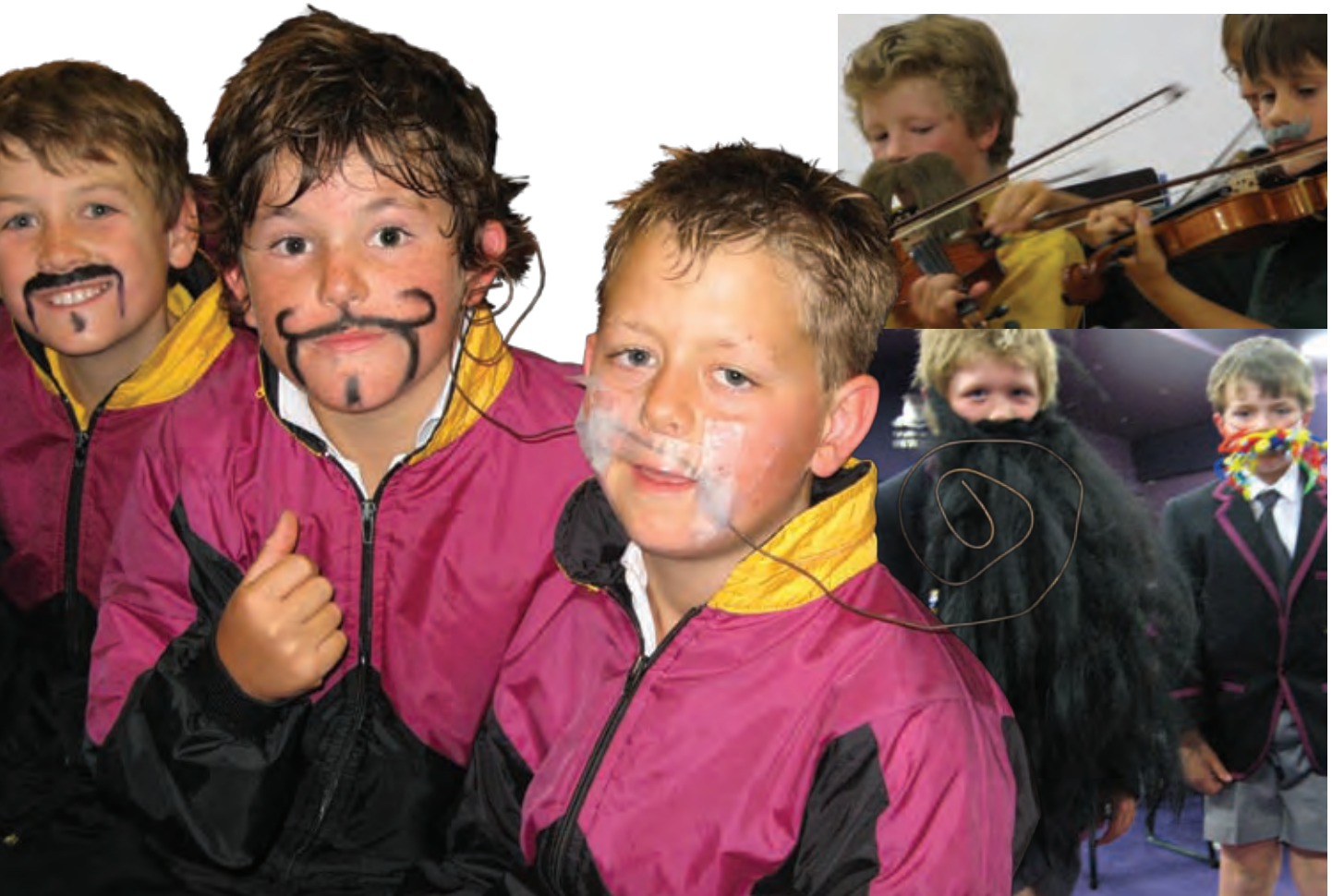
A selection of Junior School Moustaches

During November the boys and staff in Junior School really got behind the Movember project – a number of the staff were sponsored by the boys to grow moustaches, and around $700 was raised to support men's health issues, in particular Prostate Cancer research and Beyond Blue.