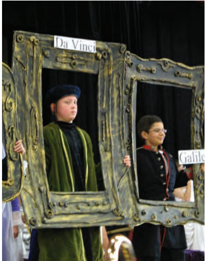
Part of the Wakakirri performance by Year Five.