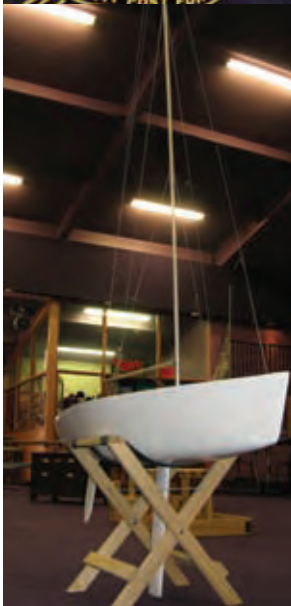
Henry Goodfellow built a large model yacht