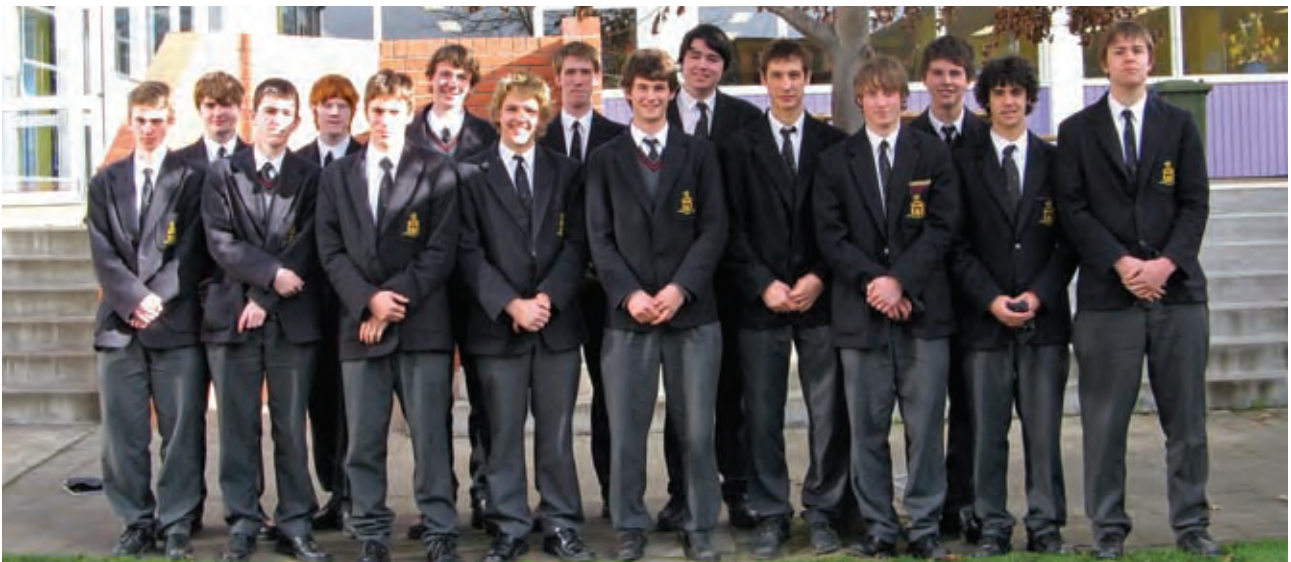
Anniversary Tie recipients 2007