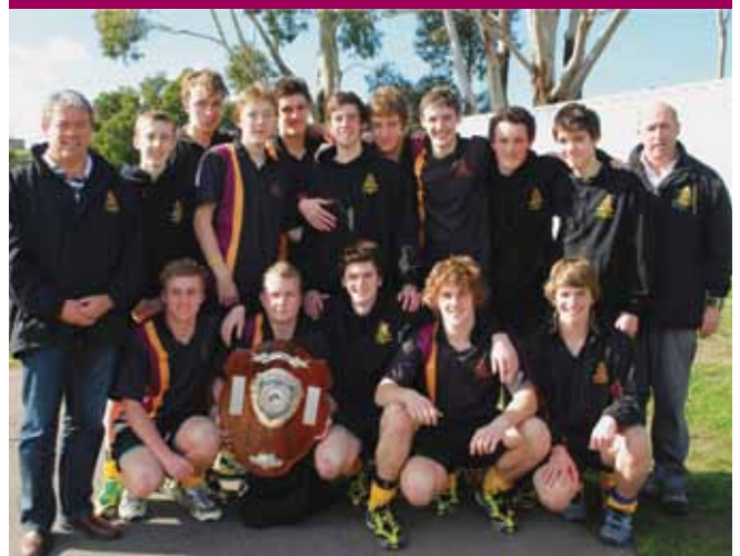
First Hockey Team.