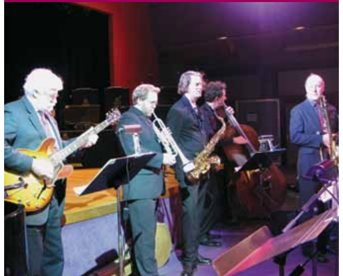
The annual jazz night always kicks off with a performance by the talented staff in the Music faculty.