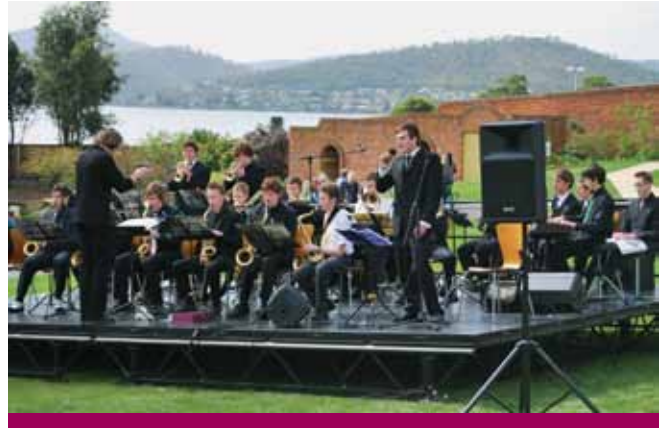
On the lawns of the Botanical Gardens.

These opportunities are a great experience for the boys.