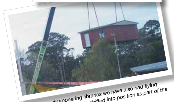
In addition to disappearing libraries we have also had flying huts – as an old classroom is shifted into position as part of the preparations for the development.