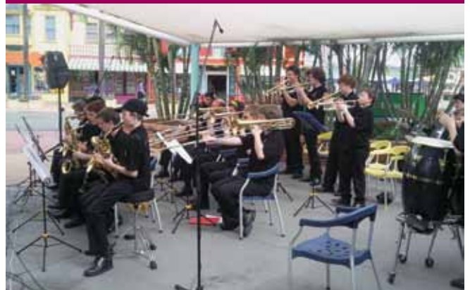
Taking it to the streets at Dreamworld in Queensland.