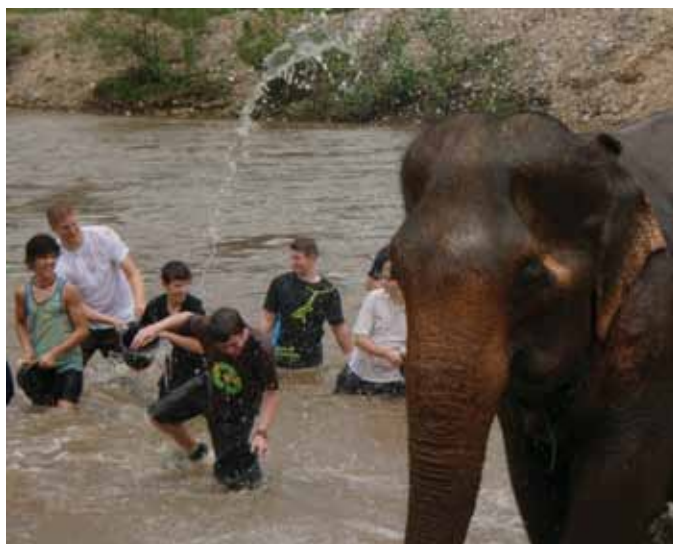
The elephant is supposed to be the one getting the bath!

We experienced farming Thai-style by visiting the local buffalo farm and rice fields. We also stayed on houseboats which were only supported by empty plastic drums.