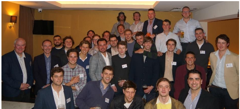
2015 Leavers Reunion at Customs House Hotel

Our 2015 Leavers gathered on Friday 25 September at Customs House Hotel, and our 5 year and 10 year groups combined for a great night reconnecting at Salamanca Inn. We were pleased to see representatives as far back as 1965. The full galleries are up on our Community Hub Photos section here.