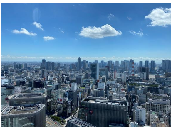
The view from his office window, looking out over the Ginza shopping district and Marunouchi in Tokyo.