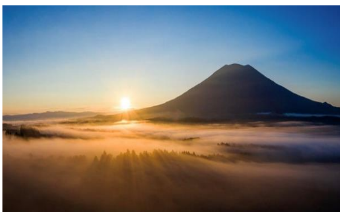
Sunrise in Niseko - one of Stuart's families favourite places to visit and relax.